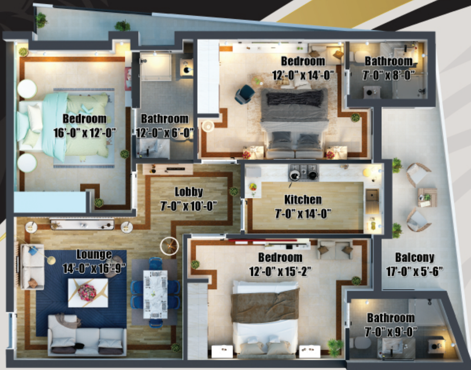
Type-A 3 BEDROOMS Area: 1,643 (sft.)