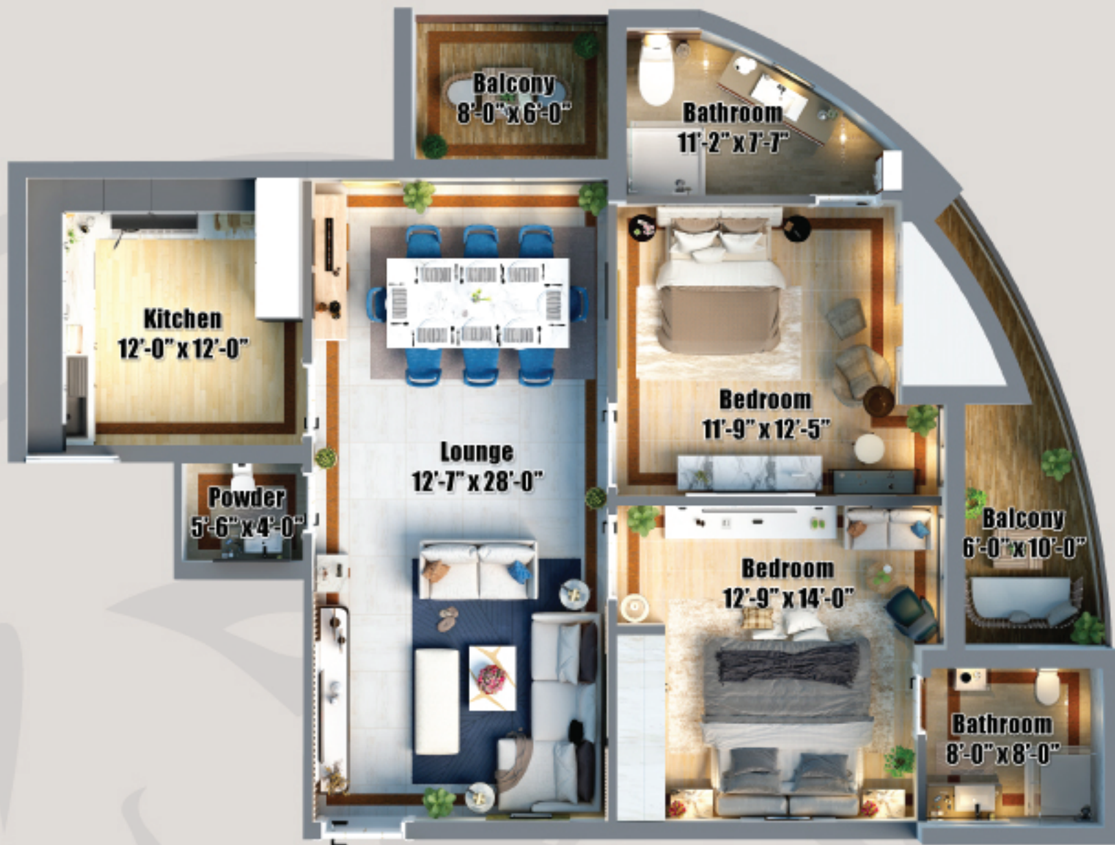
Type-B2 2 BEDROOMS Area: 1,473 (sft.)