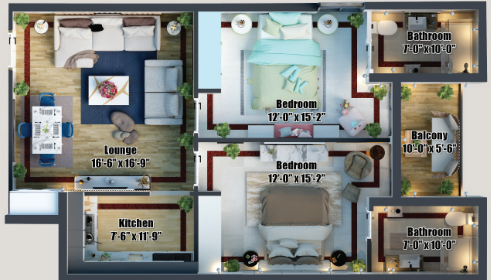
Type-B6 2 BEDROOMS Area: 1,206 (sft.)