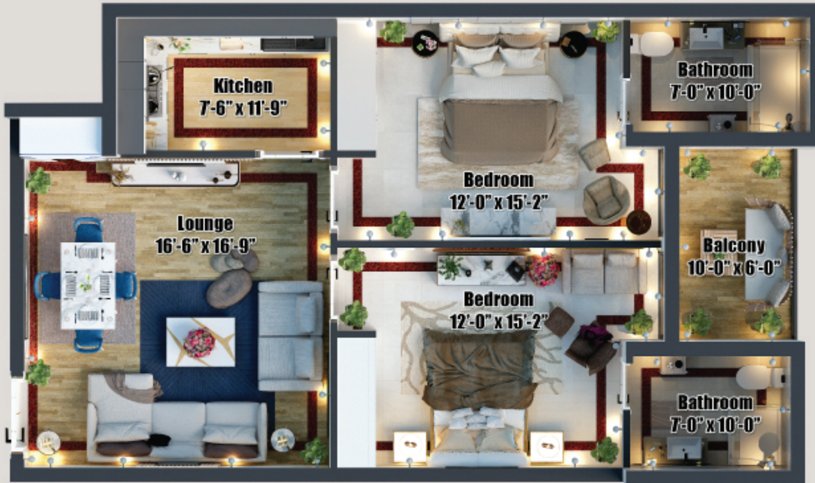
Type-B5 2 BEDROOMS Area: 1,212 (sft.)