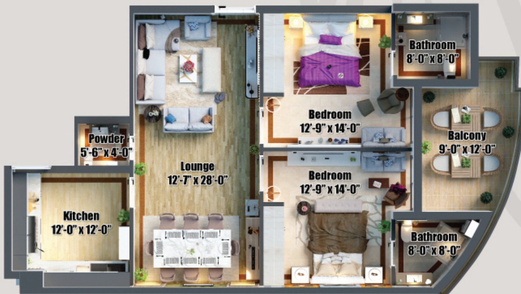
Type-B1 2 BEDROOMS Area: 1,496 (sft.)