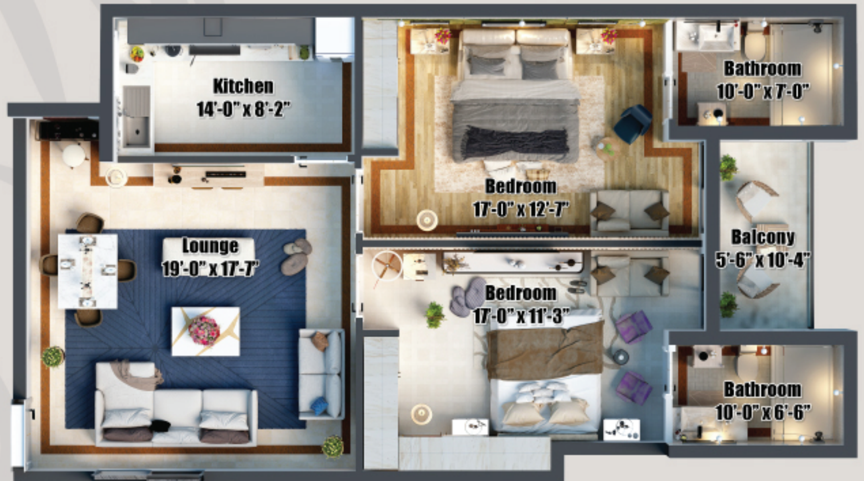
Type-B4 2 BEDROOMS Area: 1,262 (sft.)