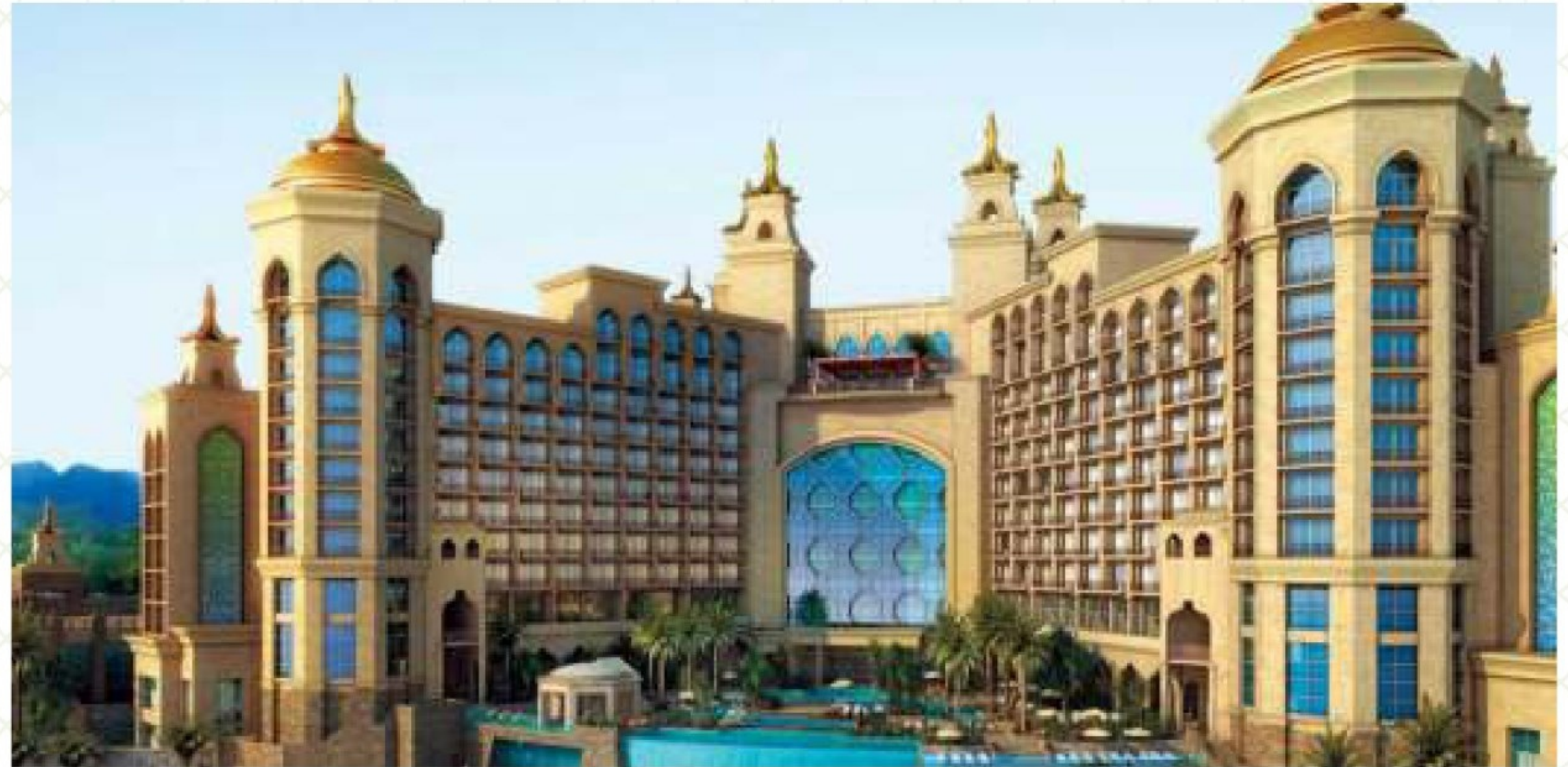
Grand Hyatt Hotel, Bahria Golf City