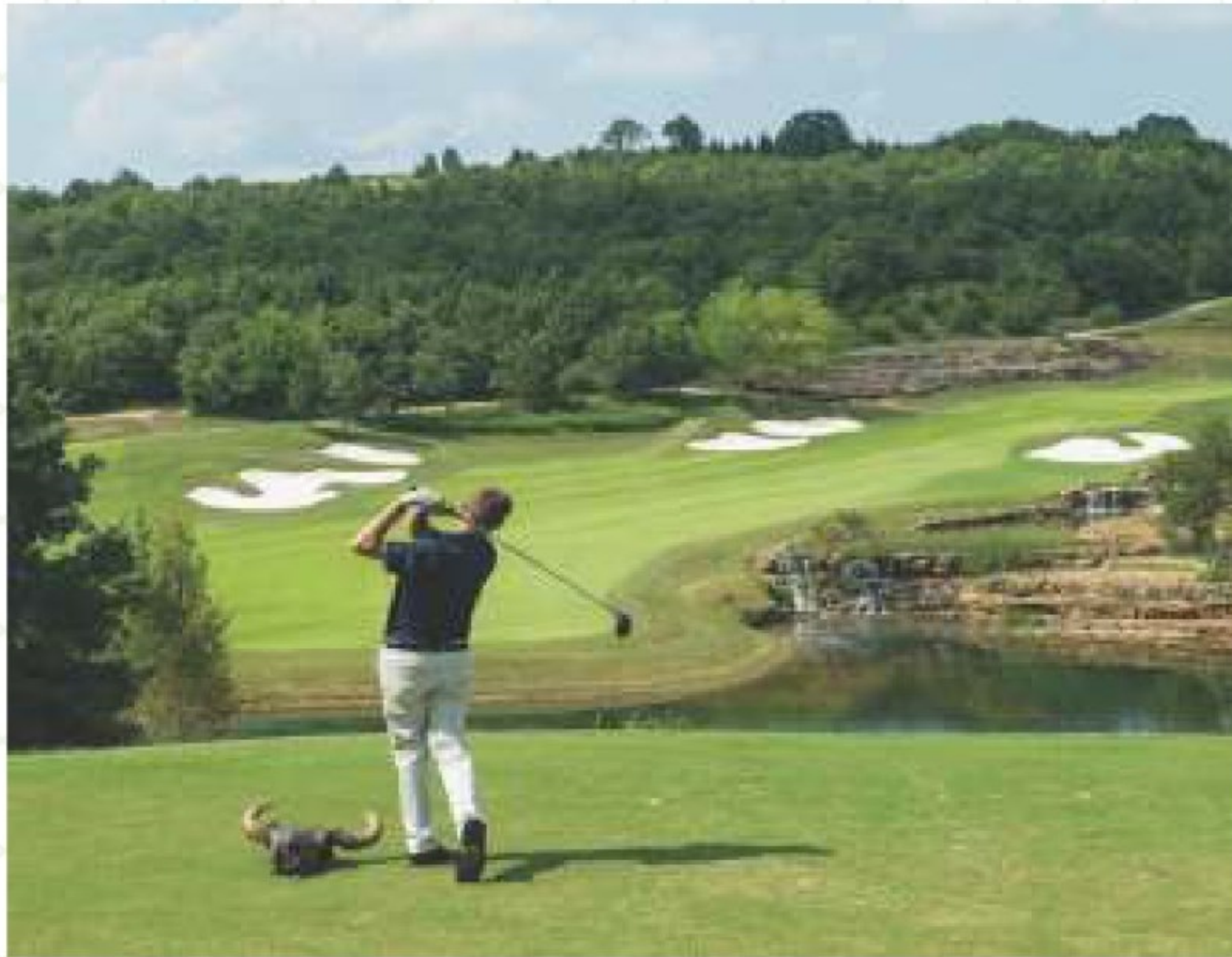
18-hole International Standard Golf Course, Bahria Golf City